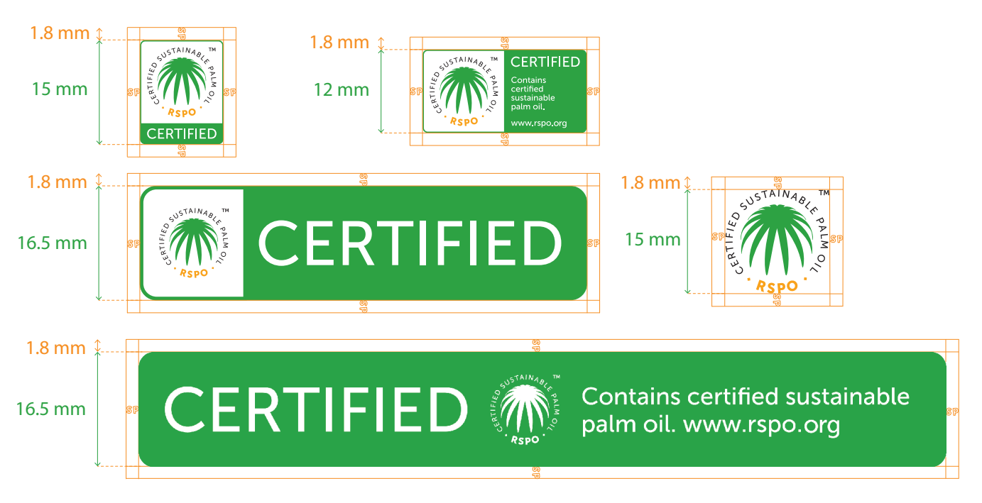
Figure 5: Clearance areas and minimum sizes