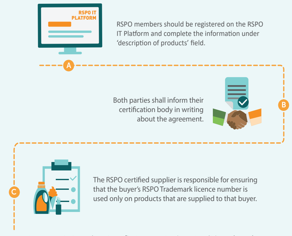
Figure 1: RSPO Product-Specific Communications Conditions (5.1.5)